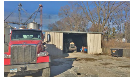
Looking North at Storage Building on Property