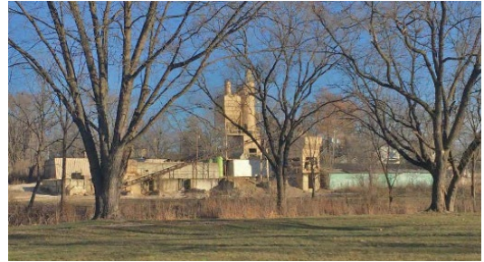
Looking East at Property