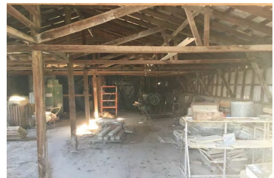
Storage Building Interior