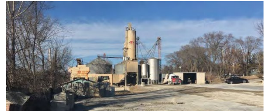
Looking North at the Property