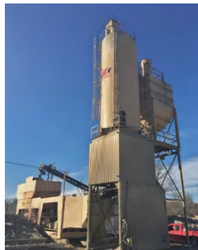
Looking Northwest at mixing equipment on property

The Iowa DNR Derelict Building Grant Program provided funding for asbestos abatement in 2019-2020 and arsenic levels were under state levels so no additional cleanup was required. The site was awarded the derelict building grant and deconstruction began late 2019 and was completed in 2020. The City diverted over 71% of the waste from the site with over 13,397,126 pounds of material removed from the site. Concrete totaled 6,670 tons with 100% of that waste stream recycled. The City is in negotiation with a developer to incorporate a creative approach to reusing grain elevators that were left on the site. The site will be redeveloped into a new mix-use development including commercial and residential properties. Redevelopment will begin summer of 2020.