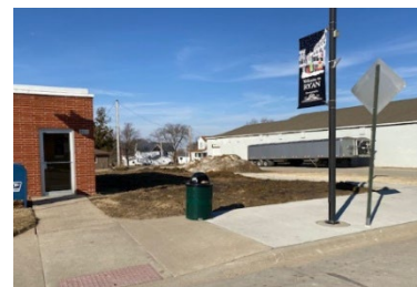
After demolition – Main Street View