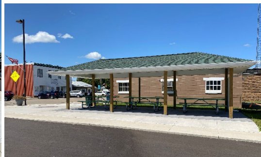
After – Side Street view of new pavilion