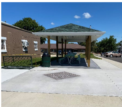
After – Street view of new pavilion