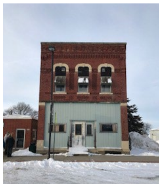
Front of Building - Main Street)

This two-story brick building with limestone block foundation was built circa 1900 on 0.07 acres of land.