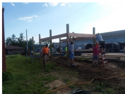
Construction of new pavilion

The city obtained a grant from Future Foundation of Delaware to create a corner street park pavilion for use as a pocket neighborhood park/community gathering space for community events such as farmers market. New sidewalks have been installed on the site along a bike rack, three picnic tables, a pavilion and a bus stop. This redevelopment project was completed in the summer of 2020.