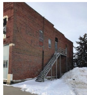
Right Side (East Side)

The City of Ryan acquired the site, abated and demolished the building with funding from the Iowa DNR Derelict Building Grant for abatement and deconstruction of the structure. Afterwards, an environmental consultant inspected the site and deemed it to be ready for reuse/redevelopment.