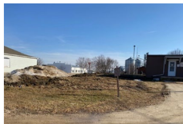
After demolition - View from Back of Property

The city obtained a grant from Future Foundation of Delaware to create a corner street park pavilion for use as a pocket neighborhood park/community gathering space for community events such as farmers market. New sidewalks have been installed on the site along a bike rack, three picnic tables, a pavilion and a bus stop. This redevelopment project was completed in the summer of 2020.