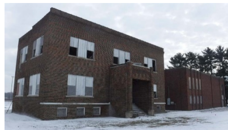
Facing Front of property – Before Demolition

Following this, the City of Dundee received a derelict building grant from the Iowa DNR to help finance asbestos abatement and deconstruction of the building. The building was demolished in early 2019 followed by restoration of the site with backfilling, topsoil and seeding. Currently the city is awaiting funding for redevelopment of the site. The city plans to expand its ball park.