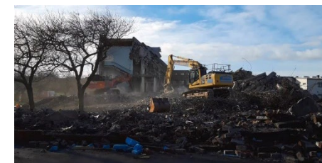
Demolition of property