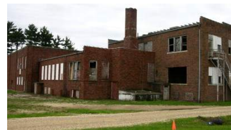
Facing back of property – Before Demolition