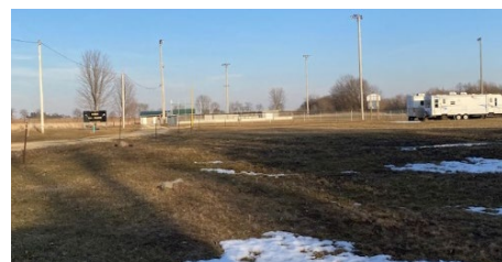
Post demolition of property

Site Address: 122 East St. Riverview St, Dundee IA Parcel #: 510000106510