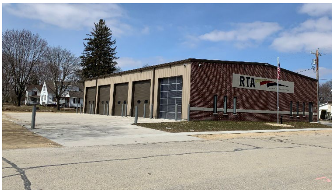
Newly Built Property after deconstruction