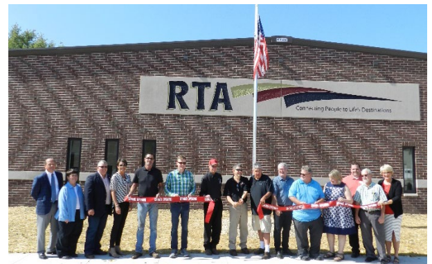
Ribbon cutting ceremony

Site Address: 123 Maple St, Earlville, IA Parcel #: 550000101900