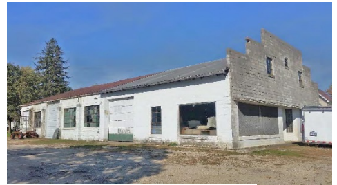
Property Before Deconstruction

The Region 8 Bus Storage facility held a ribbon cutting ceremony in September of 2019 and all Delaware County operations were moved to this facility. The project is currently being nominated for an “All Star Community” award from the Iowa League of cities. A time-lapse video can be viewed online at: https://www.youtube.com/watch?v=-5D4CVCGBrq .