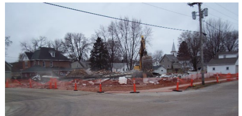
Empty Property After Deconstruction