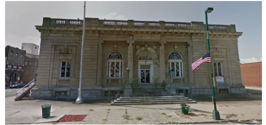
South Side exterior

In 2019, ECIA was able to use its U.S. EPA Brownfields Assessment grant funding to have a Phase I Environmental Site Assessment prepared for the property. Further testing and sampling for potentially asbestos and lead contaminants on the site will be required prior to renovation and reuse. The City of Clinton is in the process of seeking funding for additional assessment of the property. Once the additional assessment work and any necessary cleanup is completed the site will be marketed to developers for redevelopment.