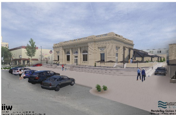
Rendering of potential future exterior