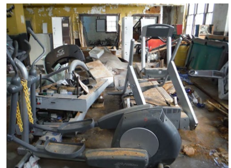
Property Interior Storage area

Site Address: 301 5 th Avenue South, Clinton IA 52732 Parcel #: 80-15900000