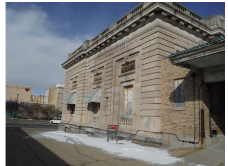
Looking Northeast at property exterior