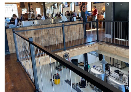
After – Brewery Interior

Prior to the property acquisition, ECIA was able to use its U.S. EPA Brownfields Assessment grant funding to have a Phase I Environmental Site Assessment completed along with a Lead-Based Paint and Asbestos Inspection. The LBP inspection resulted in levels low enough to not warrant abatement, but practice of safe work practices was recommended. The asbestos inspection results recommended abatement and it was performed prior to reconstruction of the facility.