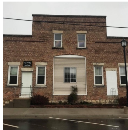
Before – Front of Property

The brewery redevelopment was completed in early July and the brewery was officially opened on July 26, 2019. Total project cost: $692,500.