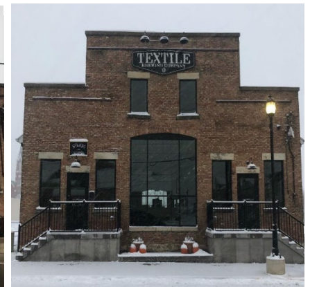
After – Front of Property

For more information on the brewery and the different brews they have to offer, please visit: